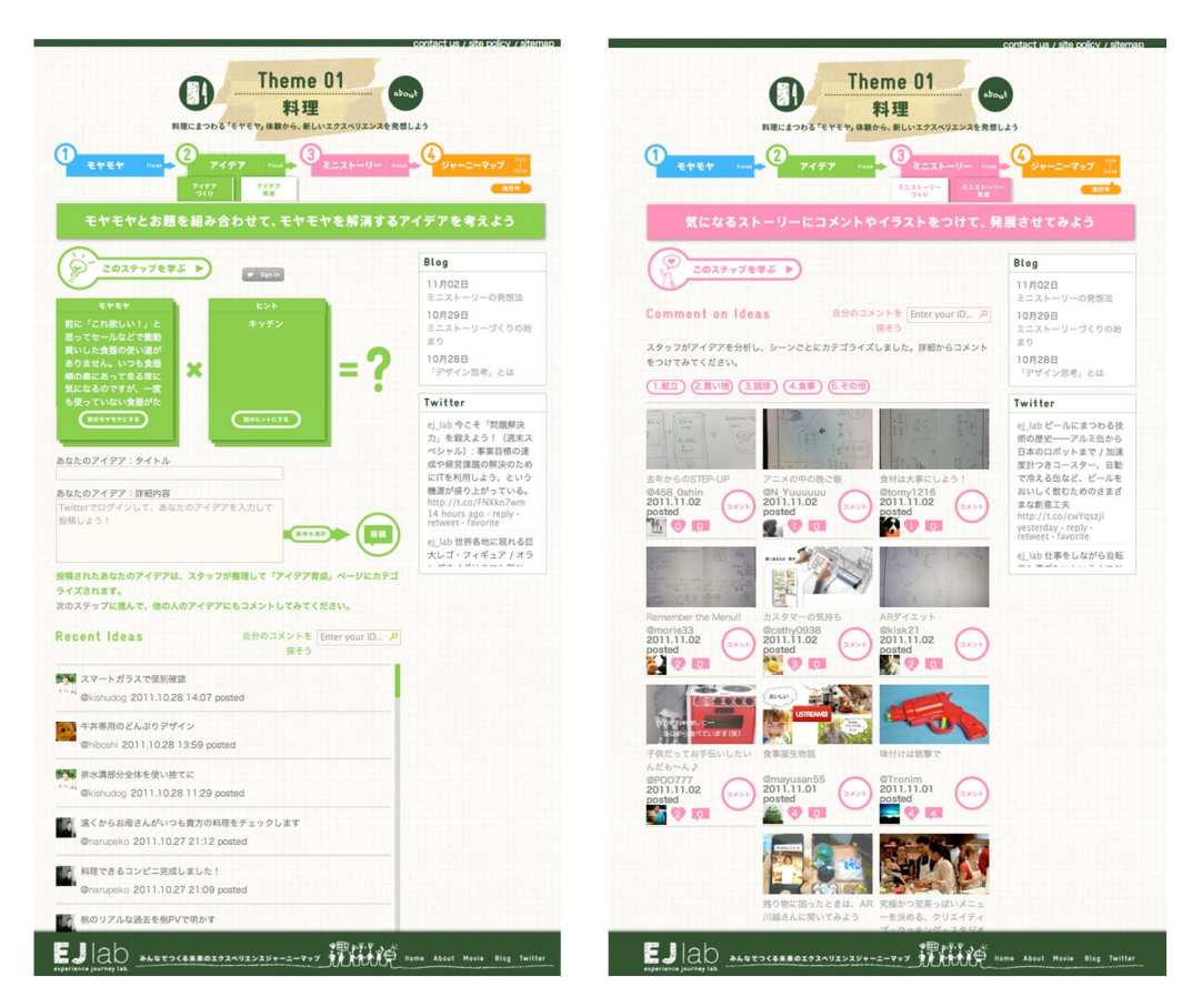
Figure 2 Experience Journey Lab.

Note that as EJL was developed in Japan and is currently being tested with Japanese participants, all the language